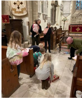
Worship time. We follow the rector in all things